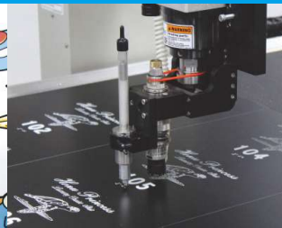
ADA Braille Sign