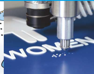
ADA Braille Signs