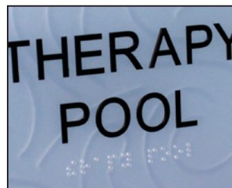
ADA Compliant Signage