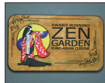
Print to Cut